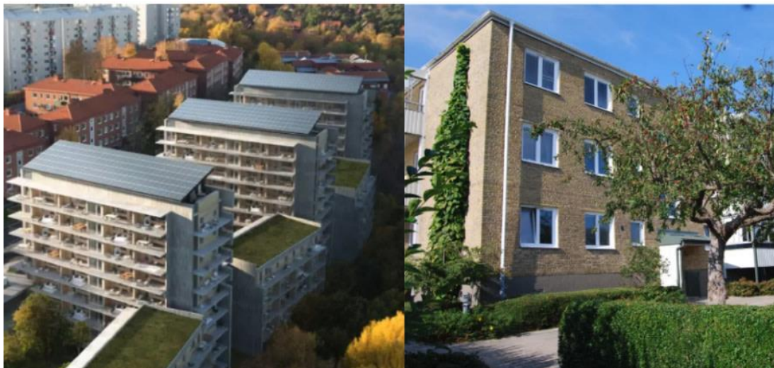
Figure 5 Viva housing association in Gothenburg