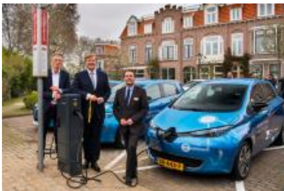
Figure 4 King of the Netherlands inaugurates new bidirectional ecosystem in Utrecht World premiere for Renault and We Drive Solar

His Majesty King Willem-Alexander launched a new durable energy and mobility ecosystem in Utrecht on 21 March 2019. The system deploys shared electric Renault ZOE cars and charging stations, enabling the Renault ZOE to both charge and discharge.