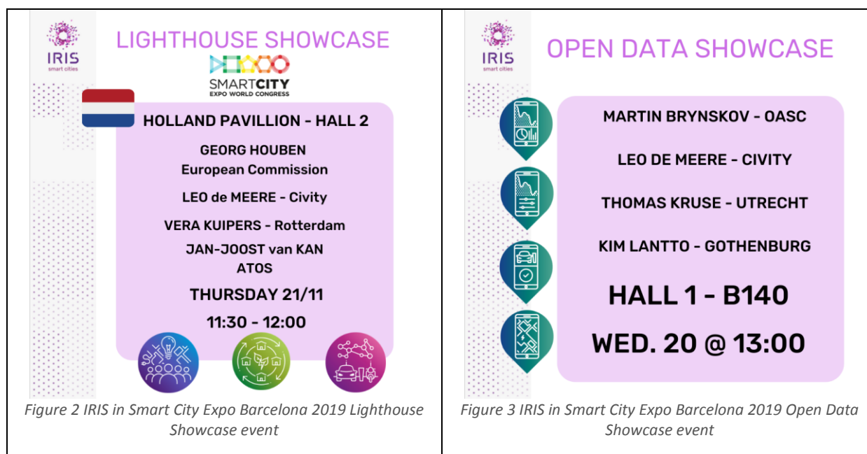
Figure 2 IRIS in Smart City Expo Barcelona 2019 Lighthouse Showcase event